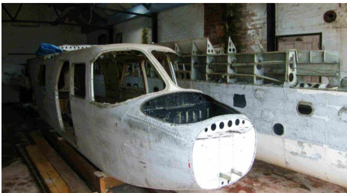
Charlie November's fuselage and wing under cover in the East Wight Workshop November 2010

Following the successful move in July of "Charlie November" from the B-N Works to the new East Wight workshop, work has progressed at a steady pace to construct new wing stands and a more substantial fuselage cradle. Meanwhile building work has been underway to adapt the workshop building with an enlarged access door, new electrics and lighting. Further work is continuing to seal the floor, paint the wall and roof trusses and round up work benches and cupboards to enable restoration work to proceed in an efficient and safe manner.