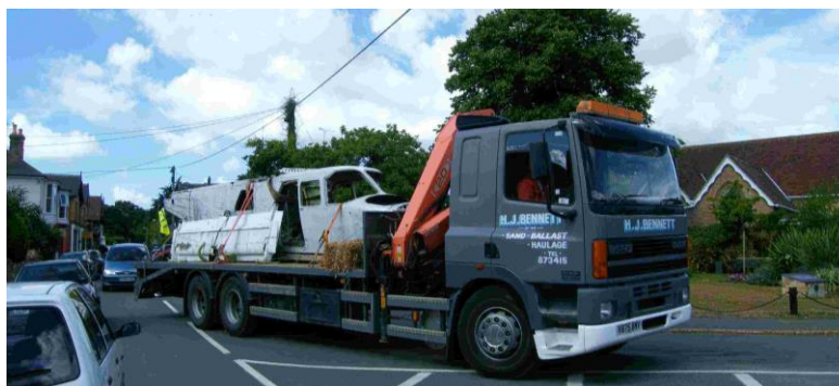
On 17 July 2010 "Charlie November" was transported from the B-N site at Bembridge Airport for a new home in the East Wight

In recognition of the historic significance of Islander G-AVCN a working group was formed in May 2009 to see how best to re-start the project. It was decided that a new location should be found as the first priority. At one stage it was thought that a mainland facility could be a possibility but with the help of Bembridge Heritage Society a place was found in the East Wight.