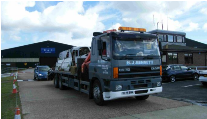
"Charlie November" Departs the B-N Works on 17 July 2010

Following the successful move in July of "Charlie November" from the B-N Works to the new East Wight workshop, work has progressed at a steady pace to construct new wing stands and a more substantial fuselage cradle. Meanwhile building work has been underway to adapt the workshop building with an enlarged access door, new electrics and lighting. Further work is continuing to seal the floor, paint the wall and roof trusses and round up work benches and cupboards to enable restoration work to proceed in an efficient and safe manner.