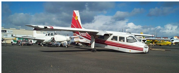
G-AVCN, usually referred to as "Charlie November", in a derelict state at Isla Grande Airport Puerto Rico, 1999

G-AVCN was first flown in April 1967 and is the third Islander produced. As the first production Islander it is the oldest of the type in existence and after delivery to Glos Air in October 1967 it later became the first aircraft to be operated by Aurigny Air Services in 1968, and is thus of unique historic importance. The restoration project began when Airstream International Group sponsored the dismantling and shipping of the aircraft from Puerto Rico in early 2000 as part of an ambitious plan to restore it to flying condition. Wightlink provided sponsorship for the final leg of the journey across the Solent to complete G-AVCN's return to its Isle of Wight home.